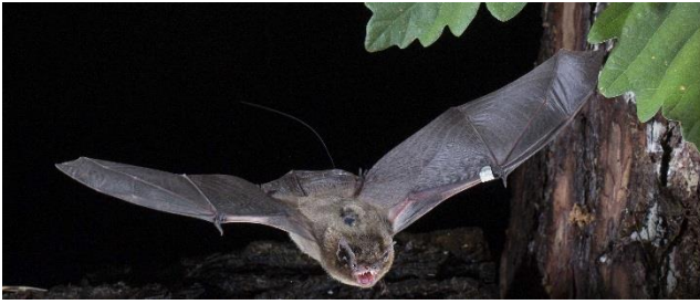
Left: tagged Nathusius' pipistrelle