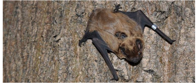
Right: tagged Lesser noctule

Day and timing of tagging will be published; recordings made during migration will be updated on a daily basis for the duration of the project.